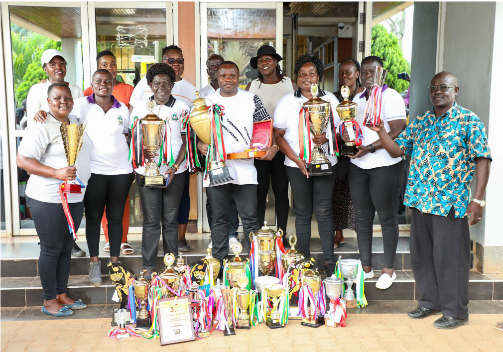
Display of trophies at the County Headquarters