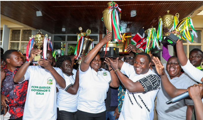
Jubilations at Kakamega County headquarters after the arrival of the team from Makueni

represent Kakamega as the cause of the outstanding results in Makueni County this year. The CECM further explained that proper preparations where the participants were vetted and scrutinized from the Sub-County level led to the positive results registered by Kakamega County during the Fests; winning a total of 33 trophies, 10 more than last year's.